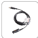
Programming cable PC155