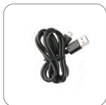
Data cable PC143