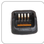
MUC Rapid-rate Charger