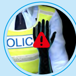
Camera Blocked Alarm