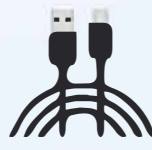
USB Type-C Data Cable