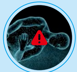
Man Down Alarm